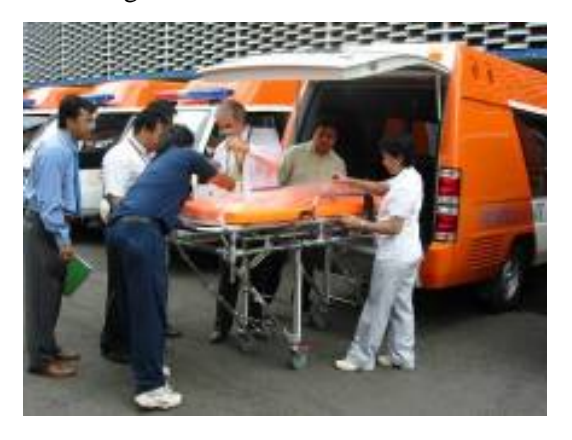
Staff checks the new ambulances

contributed to providing tangible inputs in the health sector of the 2006 UN Strategy as well as assistance in district hospitals and puskesmas in Meuraxa and Kreung Sabee Sub-Districts within the framework of the UN joint programming. With regard to the strategic planning, UNFPA supported the provincial health office in the emergency and 2005-2006 post emergency plan in partnership with World Health Organisation (WHO) and United Children's Fund (UNICEF). Furthermore, in collaboration with United States Agency for Development International (USAID), UNFPA supported the National Coordination Board for Family Planning (BKKBN) for facilitating the