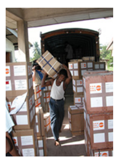
Reproductive Health kits arrive

UNFPA has strengthened national capacities in addressing psychosocial needs by providing personnel and logistical support to the Directorate of Mental Health Services (DMHS). Community based women's centers and safe spaces that address GBV and promote women's solidarity networks are being established. On behalf of the UNCT, UNFPA has taken on the focal role for coordinating the Gender-Based Violence and Psychosocial sectors. As the focal agency responsible for coordinating gender sensitive disaster response, UNFPA supported the setting up of a Gender Desk at the National Committee for Women (NCW) and continues to support efforts to monitor and ensure that gender is mainstreamed in reconstruction activities. UNFPA chairs both the UN Gender Working Group as well as the recently initiated GBV Forum.