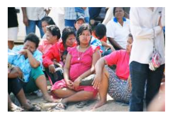
A pregnant woman in despair among other villagers affected in Ban Nam Khem Phang-nga Province.

In January 2005, UNFPA conducted a field based needs assessment in four most affected provinces in collaboration with the Department of Health, Ministry of Public Health, the Institute for Population and Social Research, Mahidol University and the WVFT. The mission identified several areas needing immediate action, with medium to longer-term relief and reproductive health (RH) care objectives.