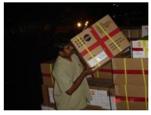
RH supplies provided by UNFPA being prepared for transportation to affected areas

UNFPA Tsunami interventions and the UNVs have been crucial in introducing outreach services to the most disadvantaged islands in the Atolls and in ensuring that the